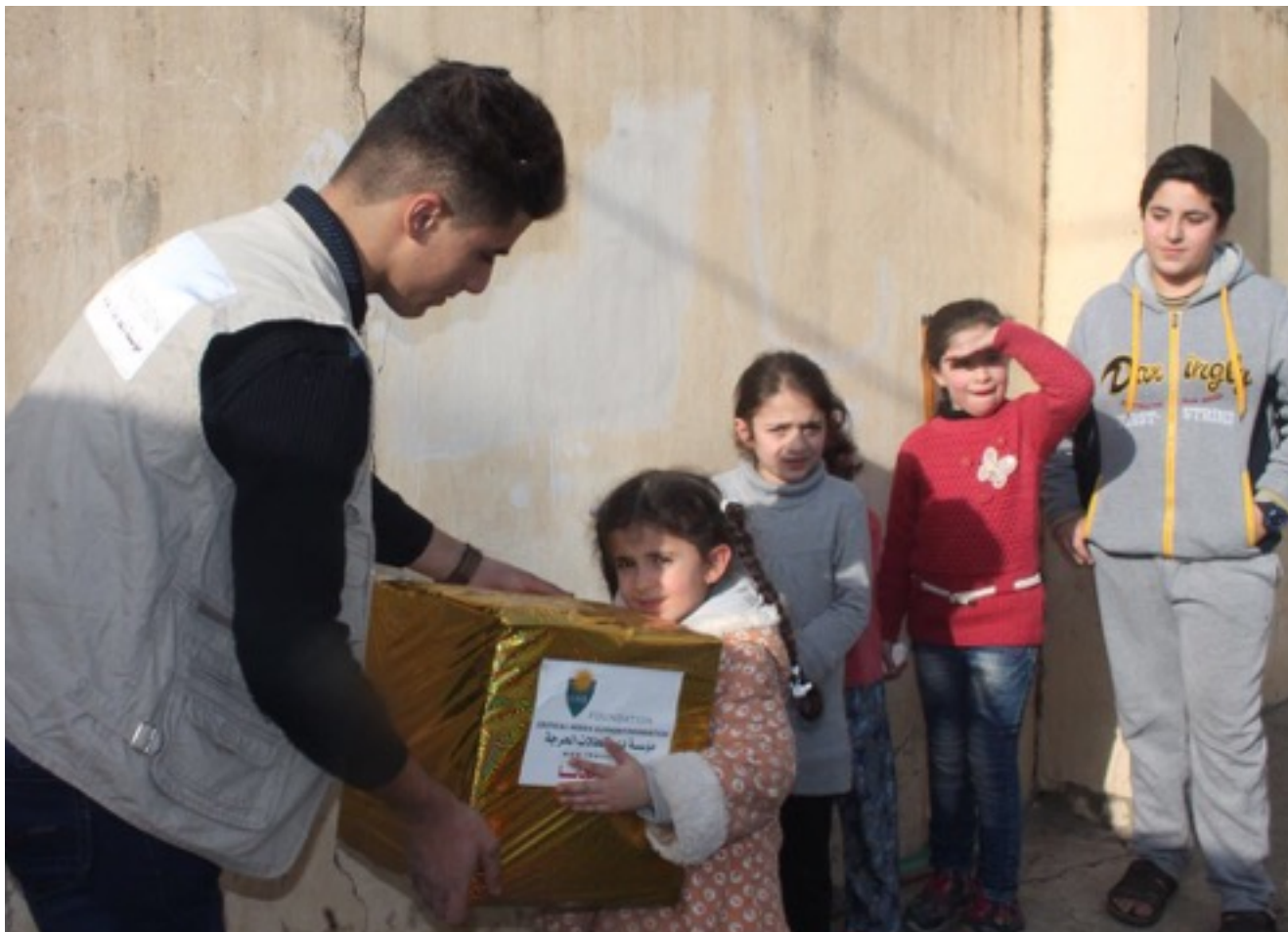
Children's drive in West Mosul

In 2017 we were able to distribute hygiene kits, winter coats, and heaters to the widows and orphans living in East and West Mosul. We continued our work with the WASH project, bringing and filling communal water tanks to families in Mosul. We supplied additional hygiene kits, food, and winterized shelters for the newly displaced people of